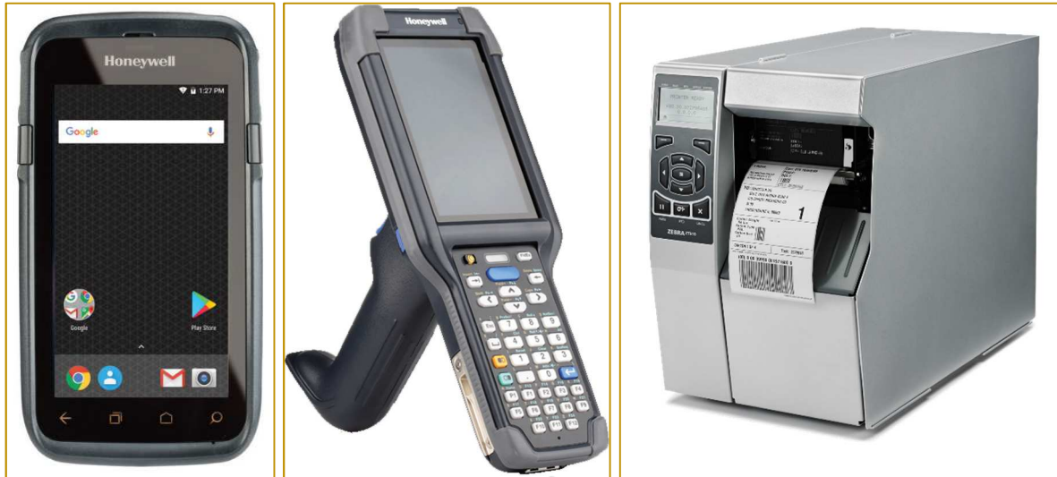
Figure 9: Barcode scanner, QR code scanner and label printer

AMS supports barcode, QR code scanning, RFID scanning and label printing functionalities for both Zebra and Honeywell devices. Our server, desktop client and android application are especially developed to fully utilize the capabilities of these devices. These include Zebra ZT510, TC51, ZD500, TC25, Honeywell RP series, CT60, CN80, PM42 and many more.